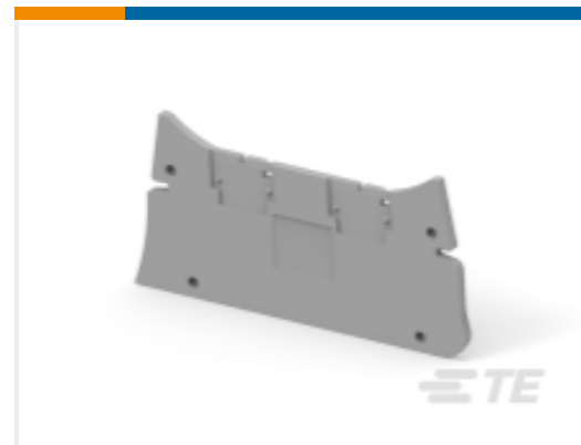
TE Part #1SNK508910R0000 ES10-ST