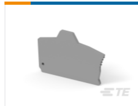
TE Part #1SNK705910R0000 EK2.5