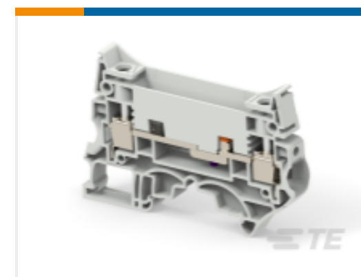
TE Part #1SNK508310R0000 ZS10-ST