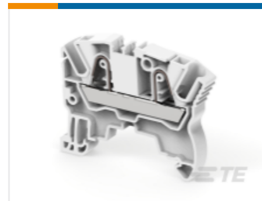
TE Part #1SNK706010R0000 ZK4