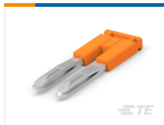
TE Part #1SNK905302R0000 JB5-2