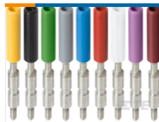
TE Part #1SNA206720R1400 AJS9-RD