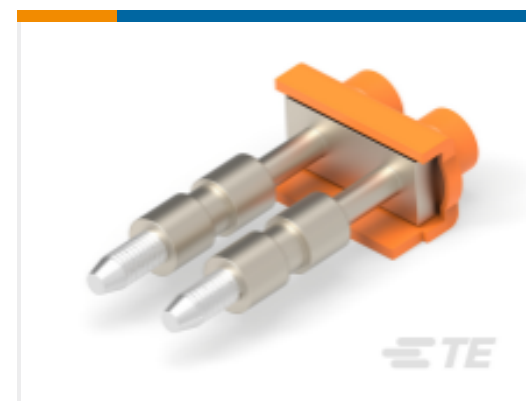
TE Part #1SNK908902R0000 JB8-2-R1