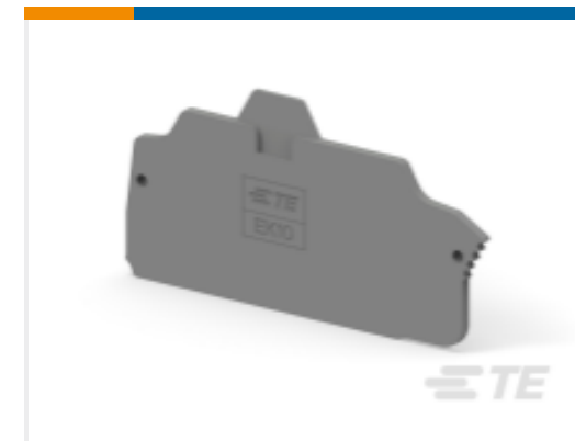
TE Part #1SNK710910R0000 EK10