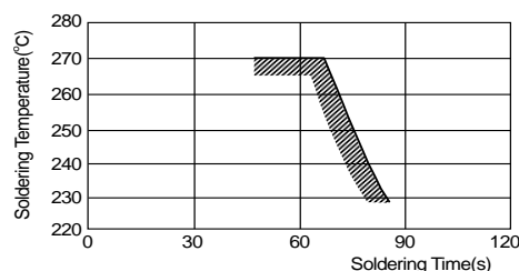
[Allowable Reflow Soldering Temperature and Time]

In the case of repeated soldering, the accumulated soldering time must be within the range shown above.