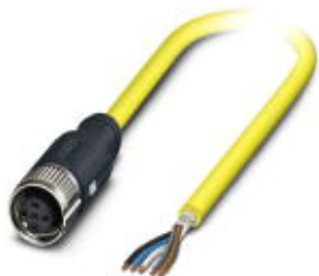
Sensor/actuator cable, 5-position, PVC, yellow, shielded, free cable end, on Socket straight M12 SPEEDCON, A-coded, cable length: 5 m

Please be informed that the data shown in this PDF Document is generated from our Online Catalog. Please find the complete data in the user's documentation. Our General Terms of Use for Downloads are valid ( http://phoenixcontact.com/download )