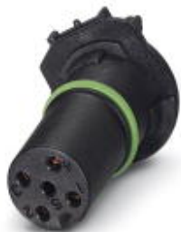
Sensor/actuator flush-type connector, socket, 4-pos., A-coded, with straight THR solder connection, only contact insert

Please be informed that the data shown in this PDF Document is generated from our Online Catalog. Please find the complete data in the user's documentation. Our General Terms of Use for Downloads are valid ( http://phoenixcontact.com/download )