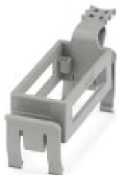
HEAVYCON DIN rail mounting frame, for type B16 contact inserts

Please be informed that the data shown in this PDF Document is generated from our Online Catalog. Please find the complete data in the user's documentation. Our General Terms of Use for Downloads are valid ( http://phoenixcontact.com/download )