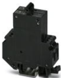
Thermomagnetic circuit breaker, 2-pos., normal blow, 1 N/O contact and 1 N/C contact, with universal foot for mounting on NS 32 or NS 35

Please be informed that the data shown in this PDF Document is generated from our Online Catalog. Please find the complete data in the user's documentation. Our General Terms of Use for Downloads are valid ( http://phoenixcontact.com/download )