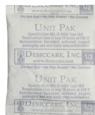
Desiccant in Tyvek® Pouch