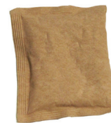
Desiccant in Kraft Pouch