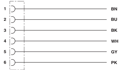
Contact assignment of the DEUTSCH DT06-6S