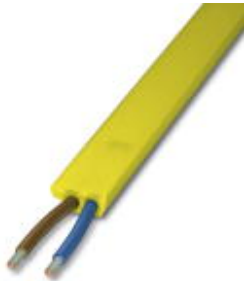
AS-Interface PUR flat-ribbon conductor in yellow, 2 x 1.5 mm 2 , 1000 m on a disposable drum

Please be informed that the data shown in this PDF Document is generated from our Online Catalog. Please find the complete data in the user's documentation. Our General Terms of Use for Downloads are valid ( http://phoenixcontact.com/download )