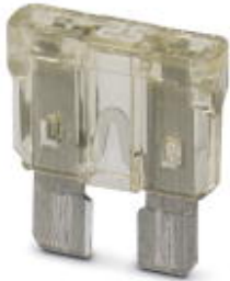
Fuse, nominal current: 25 A, length: 19.1 mm, width: 5 mm, height: 18.8 mm

Please be informed that the data shown in this PDF Document is generated from our Online Catalog. Please find the complete data in the user's documentation. Our General Terms of Use for Downloads are valid ( http://phoenixcontact.com/download )