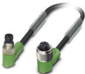
Sensor/actuator cable, 3-position, PUR halogen-free, black-gray RAL 7021, Plug angled M8, on Socket angled M12, A-coded, cable length: 0.3 m

Please be informed that the data shown in this PDF Document is generated from our Online Catalog. Please find the complete data in the user's documentation. Our General Terms of Use for Downloads are valid ( http://phoenixcontact.com/download )