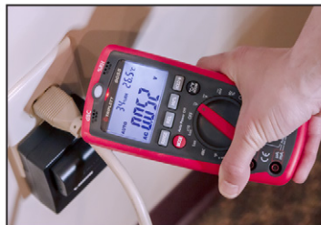
Non-Contact Voltage Sensor