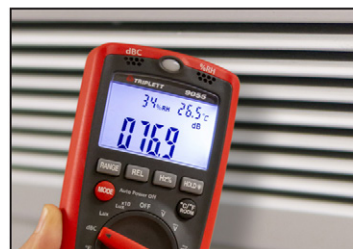
Ambient Temp & Humidity