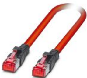
Patch cable, degree of protection: IP20, cable length: 5 m, number of positions: 8, 10 Gbps, CAT6 A

Please be informed that the data shown in this PDF Document is generated from our Online Catalog. Please find the complete data in the user's documentation. Our General Terms of Use for Downloads are valid ( http://phoenixcontact.com/download )