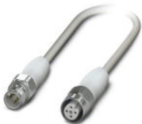
Sensor/actuator cable, 4-position, PP-EPDM halogen-free, gray RAL 7035, Plug straight M12, A-coded, on Socket straight M12, A-coded, cable length: 5 m, Hygienic design, with high-grade steel knurl

Please be informed that the data shown in this PDF Document is generated from our Online Catalog. Please find the complete data in the user's documentation. Our General Terms of Use for Downloads are valid ( http://phoenixcontact.com/download )