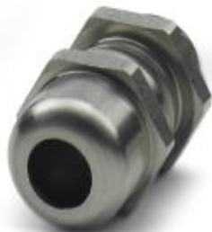
Cable gland, cable gland material: Stainless steel 1.4305, external cable diameter 3 mm ... 6.5 mm, shielding: no, connecting thread: M12 x 1.5, color: silver, with O-ring

Please be informed that the data shown in this PDF Document is generated from our Online Catalog. Please find the complete data in the user's documentation. Our General Terms of Use for Downloads are valid ( http://phoenixcontact.com/download )