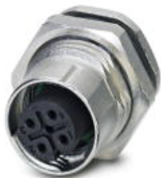
Sensor/actuator flush-type socket, 4-pos., M12 SPEEDCON, shielded, A-coded, rear/screw mounting with M12 thread, with straight solder connection

Please be informed that the data shown in this PDF Document is generated from our Online Catalog. Please find the complete data in the user's documentation. Our General Terms of Use for Downloads are valid ( http://phoenixcontact.com/download )