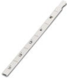
Zack marker strip, white, For terminal block width: 18 mm

Please be informed that the data shown in this PDF Document is generated from our Online Catalog. Please find the complete data in the user's documentation. Our General Terms of Use for Downloads are valid ( http://download.phoenixcontact.com )